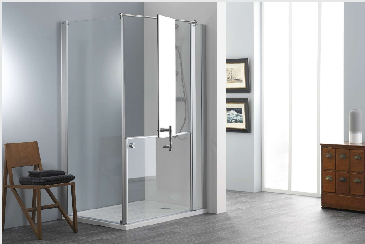
Full height fixed panel on the left L1L and an L3R on the right showing the upper door open and the lower door closed.

Selection : Choose the dimension and configuration required for each of the sides you require