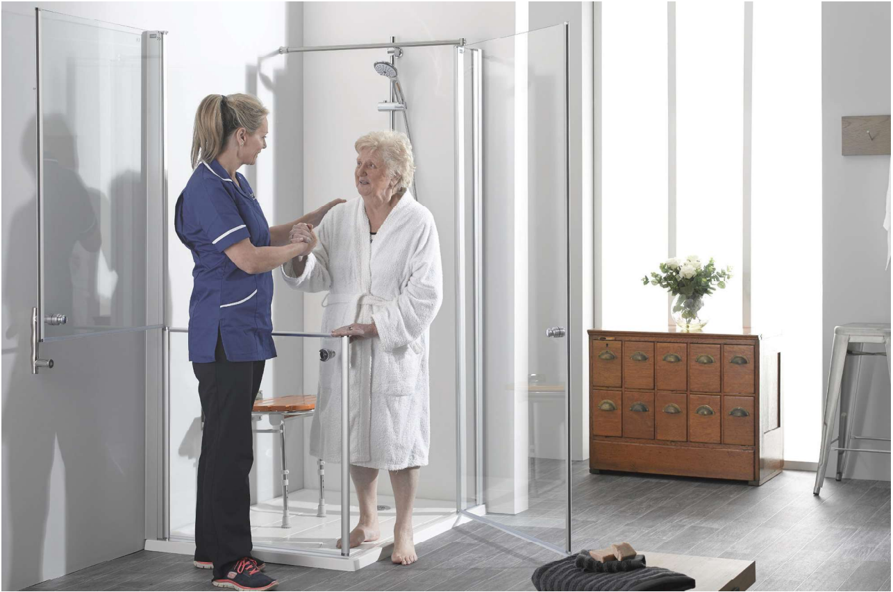
L2L on the left showing the upper door open and the lower door closed and an L6R on the right showing the door open.