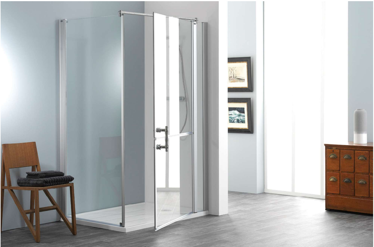
L1L fixed panel on the left and an L3R on the right showing the door open.