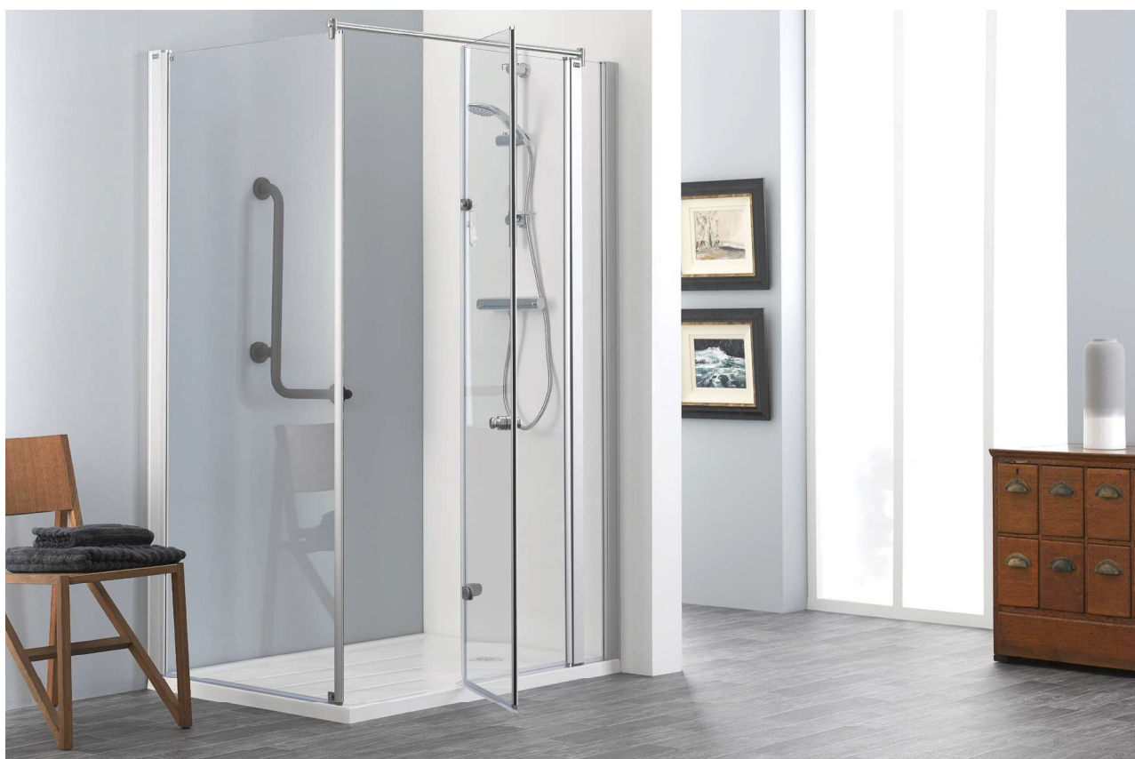
Full height fixed panel on the left L1L and an L8R on the right showing the door open.